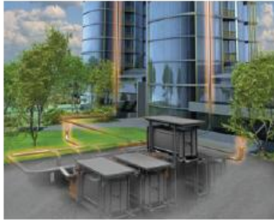
XMIT vacuum pipeline transfer system for waste and laundry