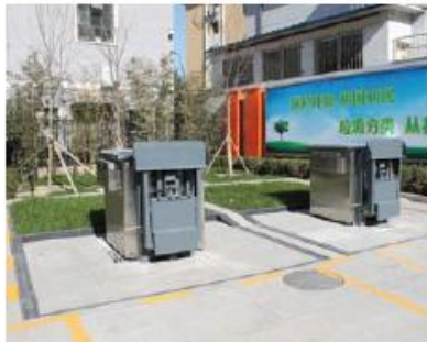
Underground waste stations